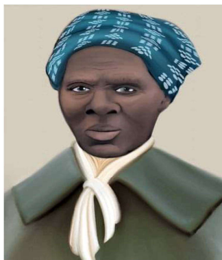
Meet Our Inspiration: Harriet Reimagined